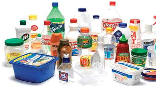
#1&2 Plastic Bottles & Containers (includes clam shells)